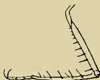
Third leg of Onychothemis testacea ( \times 1\frac{1}{2} ).